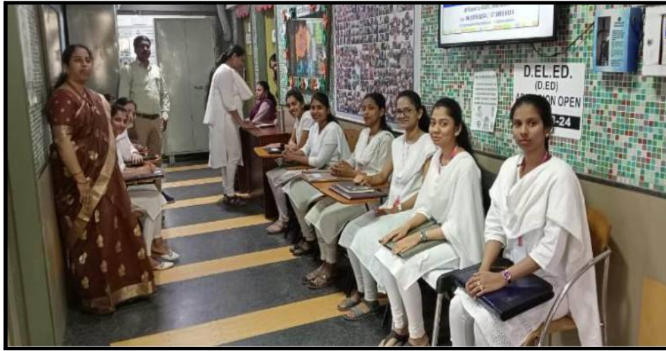
Nirmala School, Kandivali - Interview